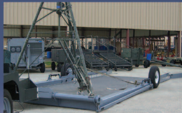
The Wing Jack Trailer is designed for wing jack transportation only.