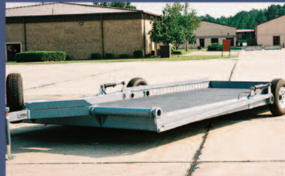
The Wing Jack Trailer features a built-in tie-down rail as well as six (6) standard "D" ring tie-downs.